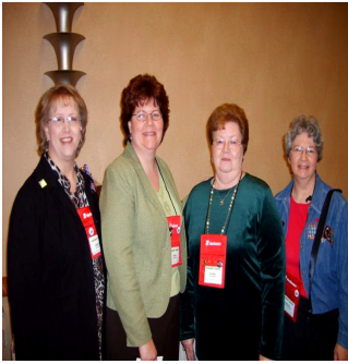
Capital Chapter members attended the 2007 TAMT conference in Arlington.